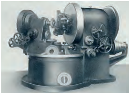
The first hobbing machine built at the Hückeswagen plant, model FK 150, construction year 1923

The KLINGELNBERG Group is the world leader in developing and manufacturing machines for bevel gear and cylindrical gear machining and precision measuring centers for axially symmetrical components and gearings . The Group also manufactures spiral-cut bevel gears to customer specifications – with ultimate precision using in-house technology.