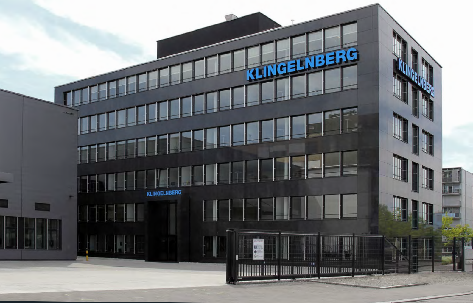
Headquarters of the KLINGELNBERG Group in Zurich, Switzerland