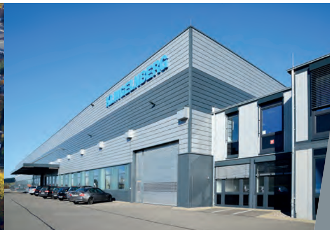
Hückeswagen (Winterhagen), Germany